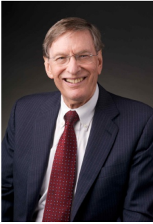
Allan H. Selig