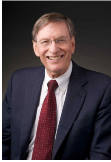
Allan H. Selig